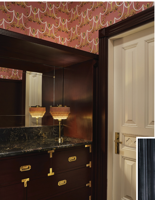
CITY SANCTUARY Clockwise from above: One of the hotel's new guest rooms; a renovated bathroom; the hotel's newly restored wide iron staircase; larger apartments are available for extended stays.