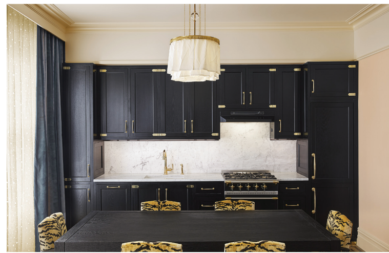
SNEAK PEEK Clockwise from left: Some of the new guest rooms include full kitchens; the retro styling is meant to capture the spirit of the original hotel; rooms feature 300-thread-count sheets.