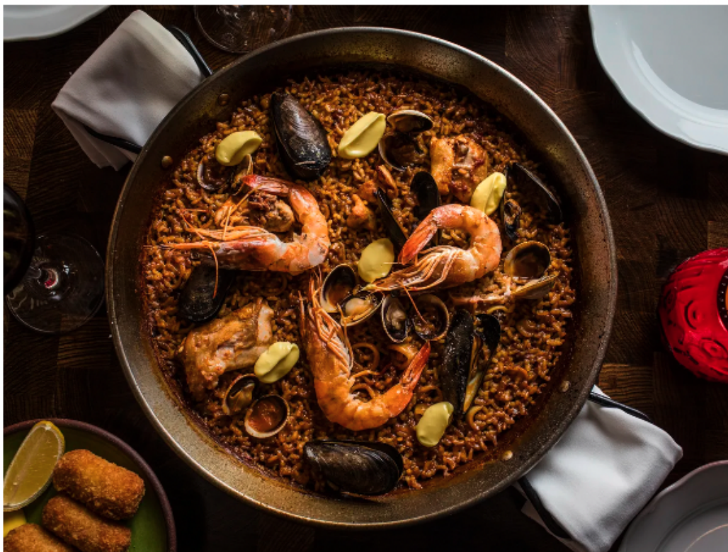
Paella from El Quijote.

https://ny.eater.com/maps/best-new-nyc-restaurants-heatmap